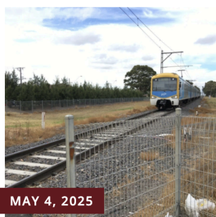
Submission: Victoria's Draft Infrastructure Strategy