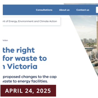
Submission: Striking the right balance for waste to energy in Victoria