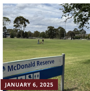
Submission on McDonald Reserve Facility Design Plan