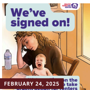
Fighting High Energy Bills for Renters: A Call to Action